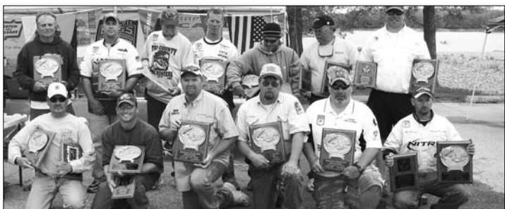
IBFN 2010 State Team - Escanaba, Mich.